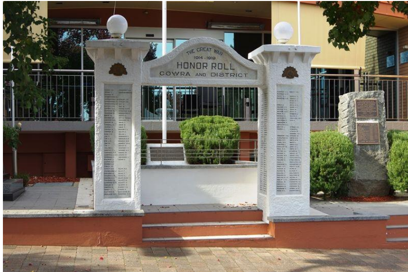
Cowra & District Honour Roll