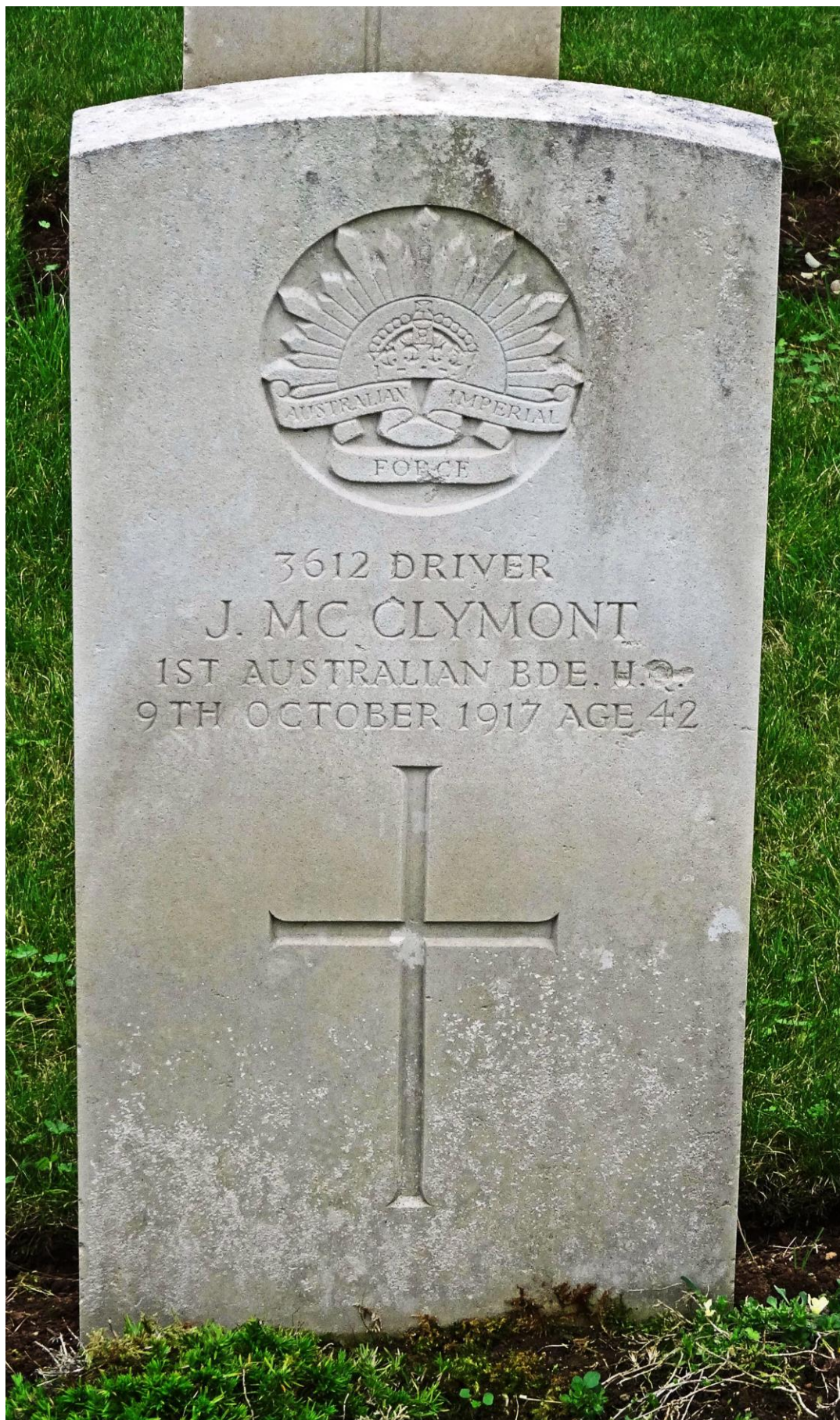
Photo of Driver J. McClymont's Commonwealth War Graves Commission Headstone in Locksbrook Cemetery, Bath, Somerset, England.